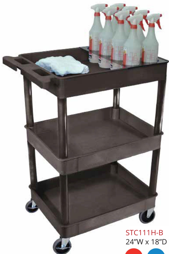
STC111H-B 24"W x 18"D x 36½"H